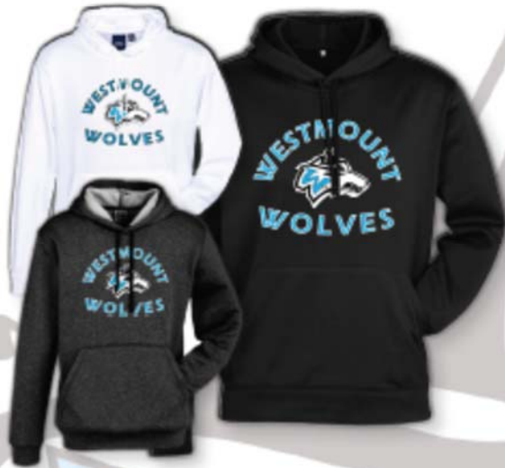
Hype Pull-On Hoodie