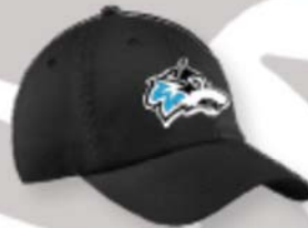
Black Fitted Mid Profile Cap