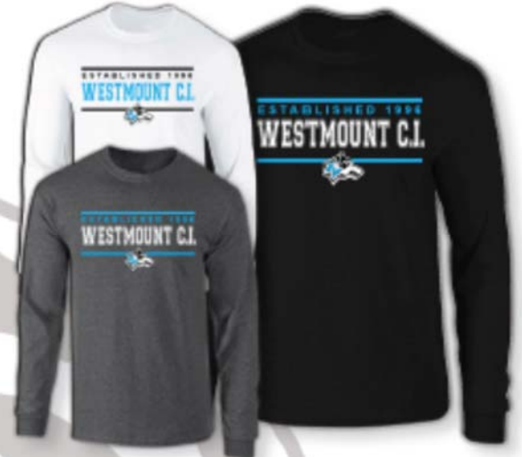
Long Sleeve Shirt