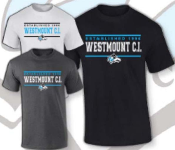
Short Sleeve T-Shirts