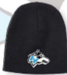
Black Knit Skull Cap